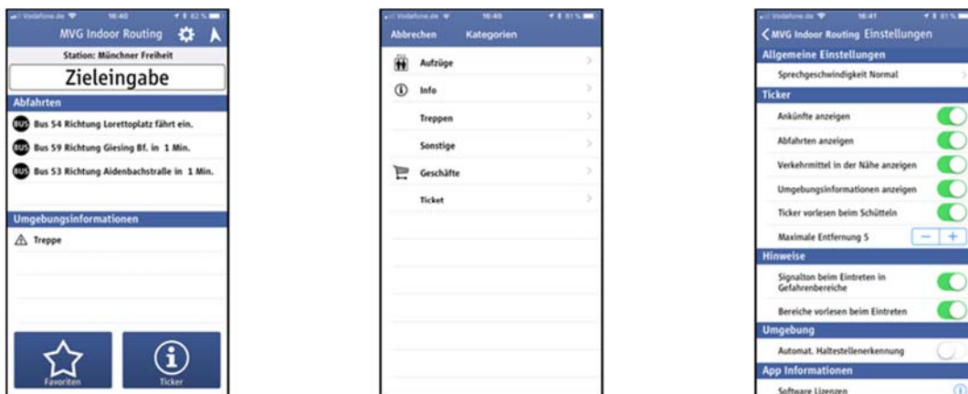
Figure 1: Screenshots of the app

For this measure, a routing application for the visually impaired will be implemented based on existing services of the local public transport corporation (MVG). This will be supported by installing beacons inside public transport stations. The beacons send bluetooth signals to users that have installed the corresponding app on their mobile devices. They can locate users as they approach, and upon receiving the bluetooth signal the app directs users with verbal instructions, such as the location of stores and ticket machines, or how many steps are in a staircase, tailored to the destination they wish to travel to. During the development phase, the beacons will be temporarily installed in a public transport station in Munich so that the application can be tested in cooperation with the local association of the visually impaired. As a result of this measure, further opportunities of using beacons for indoor routing in all public transport stations will be explored.