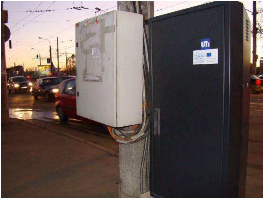
Figure 4: Traffic light control system at a junction on the priority corridor

Iasi City Hall, working with a specialised company, has installed on the CIVITAS corridor the following equipment: