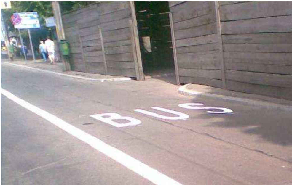
Figure 1: Lane marking of the bus priority lane on Independentei Boulevard

The layout of Independentei Boulevard is shown in schematic form in Annex 1 and in the following pictures.