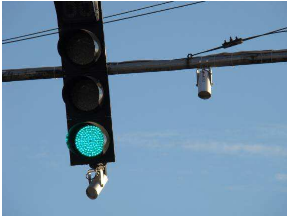
Figure 3: Traffic signal and radar detector at a junction on the priority corridor.

A full specification is presented in Annex 3.