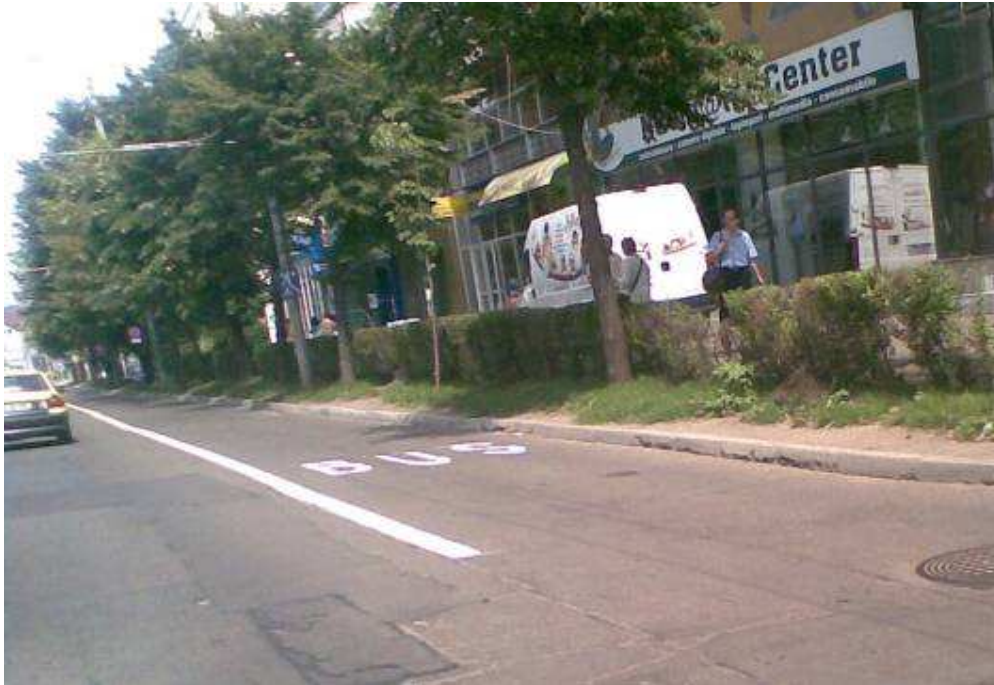
Figure 2: Lane marking of the bus priority lane on Independentei Boulevard

Independentei Boulevard is one of the busiest routes in Iasi, along which many representative institutions of the city are located: the impressive University Hospital and the University of Medicine and Pharmacy Grigore T. Popa; also, 100 metres away from these famous buildings, two important high schools can be found: the High School for Arts “Octav Băncilă” and College of Economics no.1 Iasi.