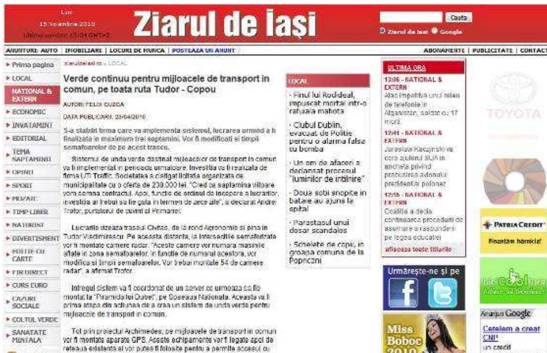
Figure 1: Positive article about green light corridor – local newspaper

http://www.ziaruldeiasi.ro/local/verde-continuu-pentru-mijloacele-de-transport-in-comun-pe-toata-ruta-tudor-copou-ni6ape