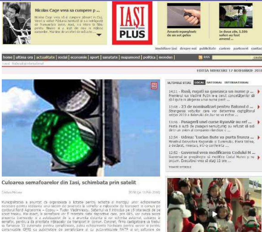
Figure 5: Positive article about green light corridor – local newspaper

http://www.iasiplus.ro/news/5/22577/Culoarea+semafoarelor+din+Iasi,+schimbata+prin+satelit.html