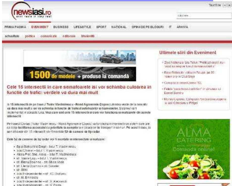
Figure 4: Positive article about green light corridor – local news portal

http://www.newsiasi.ro/eveniment/actualitate/cele-15-intersectii-in-care-semafoarele-isi-vor-schimba-culoarea-in-functie-de-traffic-verdele-va-dura-mai-mult.html