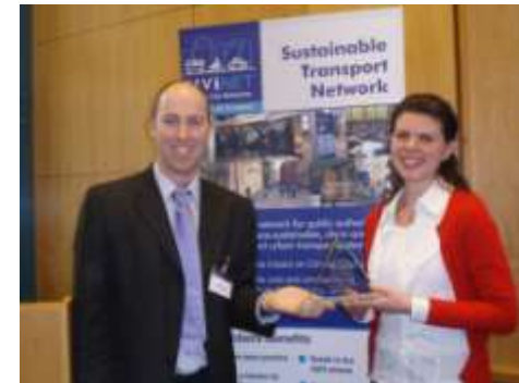
Awards for good practice