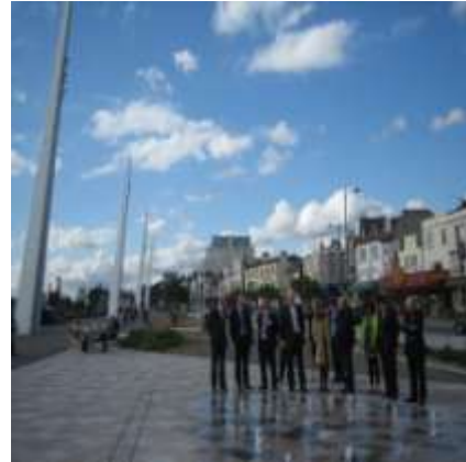
Site visits - Learning from Technical innovation