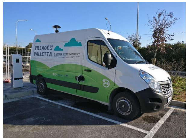
Figure 1: 'Village to Valletta' shared e-van being charged at the newly installed electric charging point at Ta' Qali crafts village parking.

Collaboration for the pilot test as part of this measure was formalised with the Ta' Qali Crafts Village, a collection of shops selling local crafts and artisanal products. They supply a number of souvenir shops in Valletta and agreed to test out the use of a shared electric van to deliver their goods from their location in the centre of the island to Valletta. The van, a Renault Master Z.E., with a 35 kWh battery and a range of 200 km (NEDC 3 ), was imported and arrived in the summer of 2019 (see Figure 1).