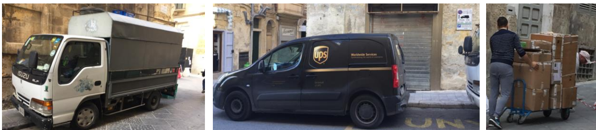
Figure 2: A variety of delivery services in the streets of Valletta, showcasing some of the challenges (illegal parking on sidewalks, lack of available unloading bays, need for deliveries on foot) 1 .

Valletta attracts a large number of tourists and visitors, and the presence of hotels and restaurants that need delivery of fresh goods daily leads to an increased morning traffic problem. The narrow streets and limited unloading space make deliveries challenging (see Figure 2). This measure consisted on the elaboration of a Sustainable Urban Logistics Plan for Valletta, as well as a pilot with private operators to test out Last Mile delivery of goods, using a shared electric van.