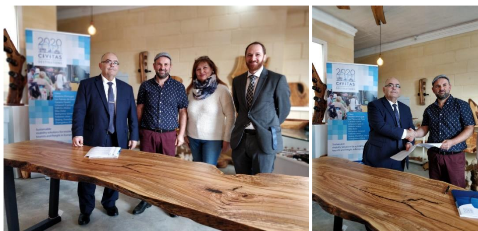
Figure 2: Signing of the agreement with the Ta' Qali crafts village Tenants Association.

Unfortunately, in October 2020 it appeared that even though the airport opened to visitors again in July 2020, the impact of the pandemic on the tourism industry was still heavily felt, with an 84% decrease in visitor numbers in July 2020 compared to the previous year 4 . Therefore, the ex-post data collection approach had to be adapted, based partially on estimations using the baseline data as guidance, and partially through a qualitative interview with the participating operators.