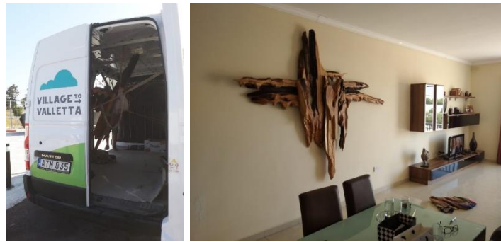
Figure 4: Using the shared e-van to transport large and valuable goods.