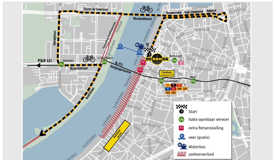
Map: 'Example of an event mobility map (Tour of Flanders 2019)

It is difficult to draw exact conclusions about how the mobility plans helped in achieving a more sustainable modal split as most of the results are from different events per year. From the campaign and survey results it can, however, be concluded that people are more conscious of their mobility choices when they are provided with detailed information.