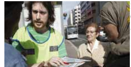
Volunteers collect information about the habits and needs of public transport users in the city

An information campaign was at the heart of this. Over 100 volunteers travelled with public transport users, provided support and informed them about the new network.