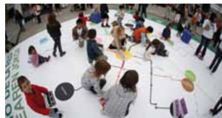
Feedback from citizens of all ages helped shape the new public transport network

Allowing for more effective transfers between lines are a range of supporting measures, including bus lanes, queue jumpers, traffic-light priorities and new platforms. The result is that passenger numbers have rocketed with a 45 percent increase in the number of trips per month. This translates into just over half a million more users since the first tramway line came into operation in January 2009.