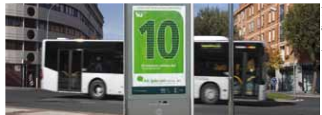
Just missed the bus? Don't worry, in Vitoria-Gasteiz there is now one every 10 minutes

The CIVITAS MODERN city changed its entire public transport system in October 2009, and the increase in passengers shows that the change is paying off. Combined with the new bicycle lane grid and pedestrian paths, the plan is adapting citizen's mobility behaviour.