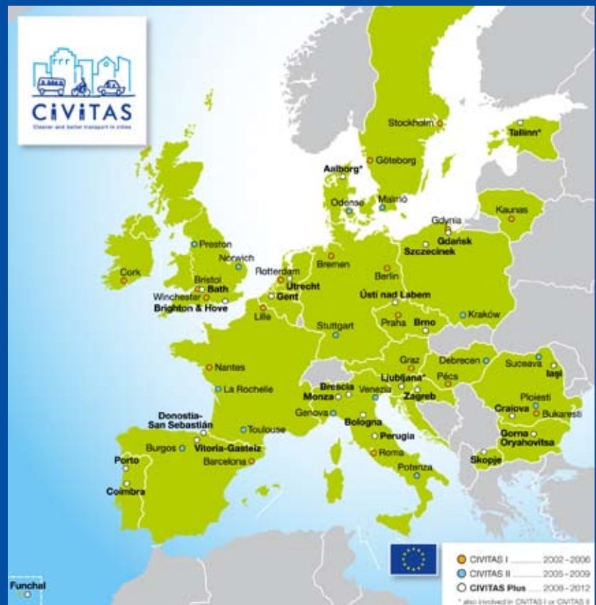
Map of CIVITAS community

For the more information please contact: www.civitas.eu