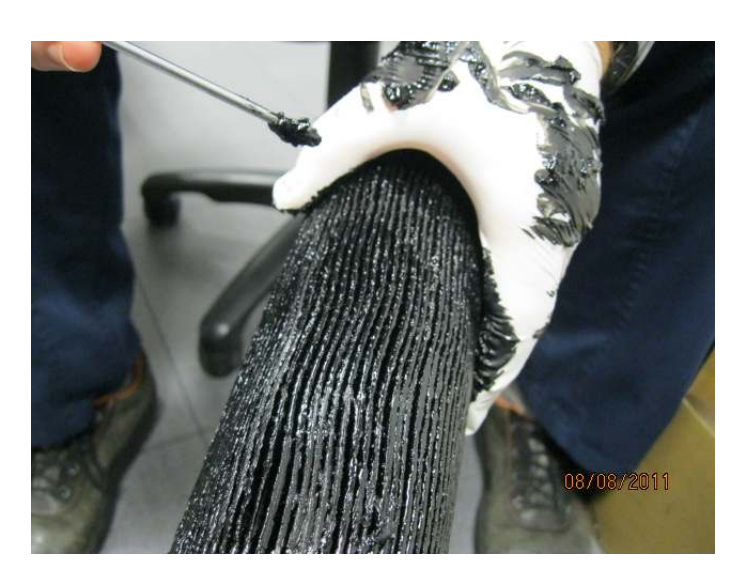
Figure 2: Dirty fuel filter