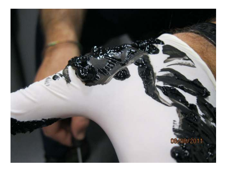
Figure 1: Waste taken from the fuel filter walls

When the fuel filters were changed, unexpected waste has been found mixed with the biofuel blend. Samples of the waste in the filters and fuel has been analysed both by the Biodiesel and the Bus suppliers, and also by independent laboratories.