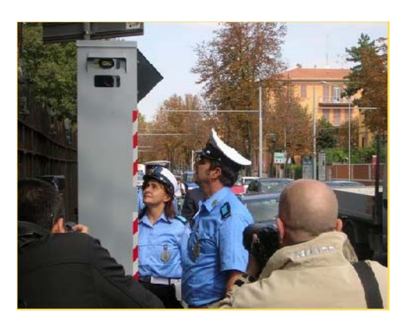
Figure 3 - STARS have been officially presented to media

the new system has been officially presented to media. The press conference took place directly on streets and was handled by the former Mayor Councillor of Urban Mobility.