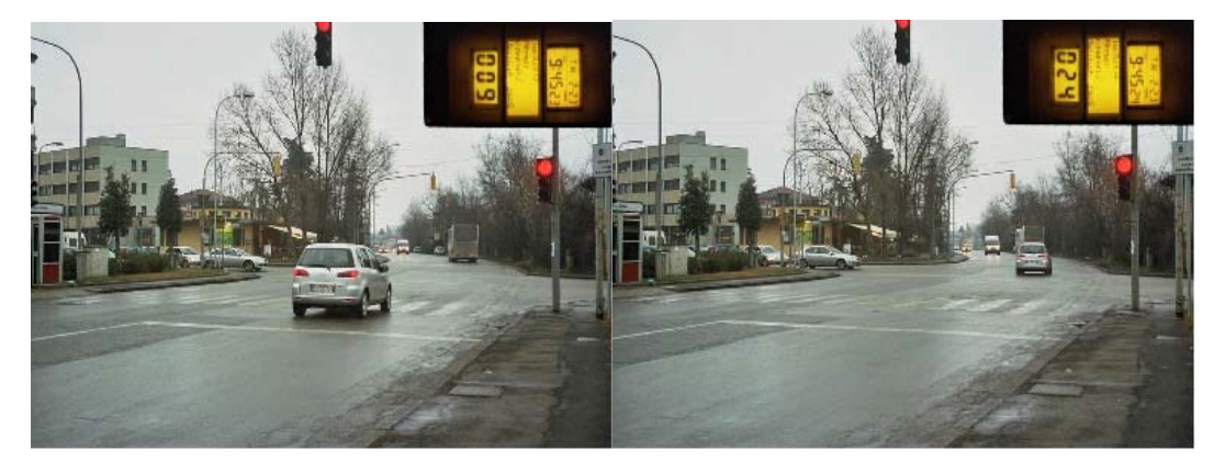
Figure 1 and Figure 2 – STARS: the system takes two photos of each vehicle passing while traffic light is red

Additionally, with a precautionary approach, the Mobility Department decided to introduce some further features to the system, namely: