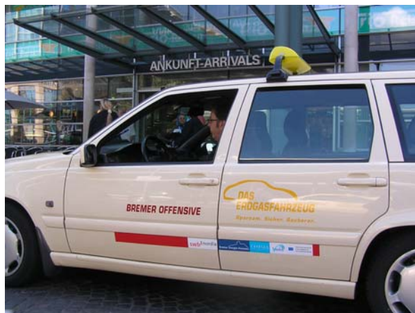
Fig 8: displays on CNG-cars

("The implementation of the Intermodal ticketing and Information centre of the PT operator BSAG is funded by the European Union within the CIVITAS – Vivaldi project for an environmentally friendly urban transport")