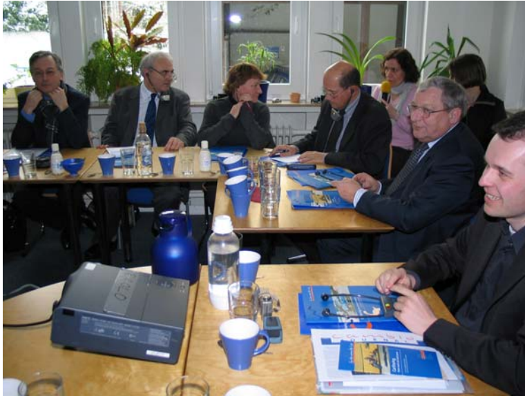
Fig.5:Delegation from Nantes, March 05

Bremen has shared its experience in many direct exchange events and bilateral workshops with other CIVITAS cities. E.g. delegations from Nantes and Gothenburg have visited Bremen for receiving deeper information of cycling measures and Car-Sharing. In case of Nantes, this has led towards concrete negotiations for a call for tender on the subject of Car-Sharing.