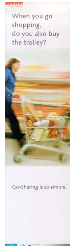
Fig. : leaflet and exhibition posters about Car-Sharing (in German and English)

In the field of Car-Sharing, Bremen has carried out an exhibition (through Vivaldi) about Car-Sharing and has initiated a "Parliamentary Evening" about this issue in the German capital Berlin.