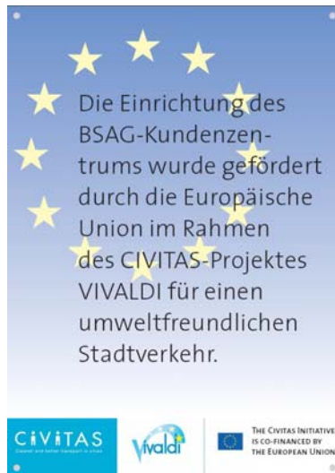
Fig 7: display for CIVITAS measures

It is worth to point out that the City of Bremen sees its role also as ambassador of CIVITAS to the citizens of Bremen. The EU CIVITAS / Vivaldi logos are highly visible in Bremen's townscape. They can be found on CNG taxis and cars, eTicketing smart cards and promotion material, at the Intermodal Ticket +Information Centre, Car-Sharing stations and cycle promotion activities. CIVITAS achieved a positive image for citizens, media and politicians in Bremen.