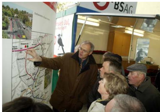
Fig.10: public discussion process for tram-train planning

In some Vivaldi fields, obstacles came up (e.g. with clean vehicles due to non-availability of 12tons CNG trucks). The programme has been adapted accordingly (e.g. by purchasing more smaller 6.5 tons CNG delivery trucks. In this process, Bremen faced the problem of being led down by the truck manufacturers. An European issue that became subject to the thematic METEOR platform meeting (Stockholm, June 04) and also in the "Stakeholder Meeting" at DG TREN together with the motor-industry (Brussels, April 05). Together with the Civitas cities Rotterdam and Stockholm Bremen worked in close cooperation on the above-mentioned obstacles.