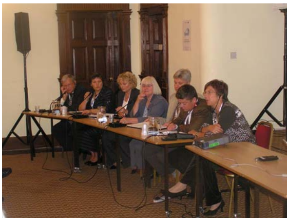
Fig. 12 :Deputy Minister Christine Kramer in the Vivaldi Political Panel Discussion

The City of Bremen understands itself as a kind of ‘broker’ in order to bring together and support the different stakeholders for sustainable mobility in Bremen and its region. The integration of innovative services into urban development and regeneration (e.g. Car-Sharing, mobility management, support for cycling and walking) is a long-term activity, which has gained much support through Vivaldi and will last there after.