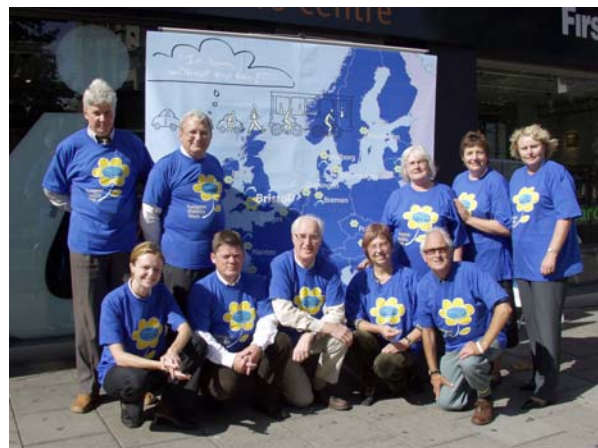
Fig. 13: ... and as partner for the Bristol Mobility Week Campaign (September 2005)