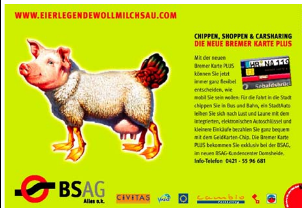
Fig. 1: Advertising the ‘egg-laying-wool-milk-saw’

The Bremen information approach about CIVITAS uses as well unconventional channels – e.g. a video contribution to the Toronto conference ‘moving the economy’ which has also been shown on other conferences in North America and Australia.