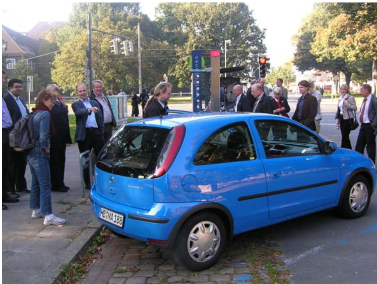
Fig.6: delegation from Gothenburg, October 05

Visiting the cambio Car-Sharing headquarter to discuss in detail the planned development of Car-Sharing in Nantes