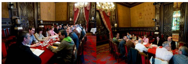
Figure 2: Diputación de Gipuzkoa Bicycle board

As part of UPV/EHU Sustainable Mobility Plan definition, the Mobility manager represents the UPV/EHU as member of the Gipuzkoa Bicycle Council (Provincial Administration of Gipuzkoa) and takes part in the Bicycle Observatory of San Sebastian.