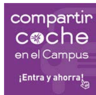
Figure 3: Car-pooling programe web banner