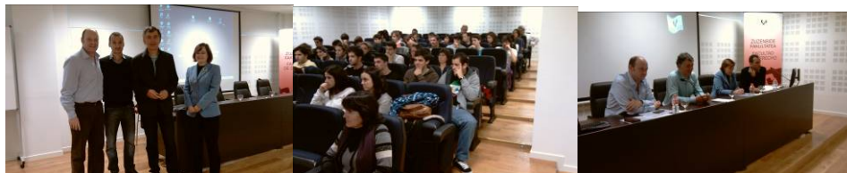
Figure 1: University Mobility Management conference organised in October 2010

UPV/EHU first proposal has been discussed in a University Mobility Management conference organised in October 2010 with the objective to exchange experiences with other Spanish Universities, with the collaboration of the Mobility Board of CRUE-CADEP (Spanish University Dean Group).