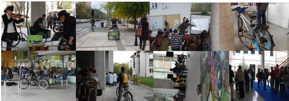
Figure 4: Awareness campaign