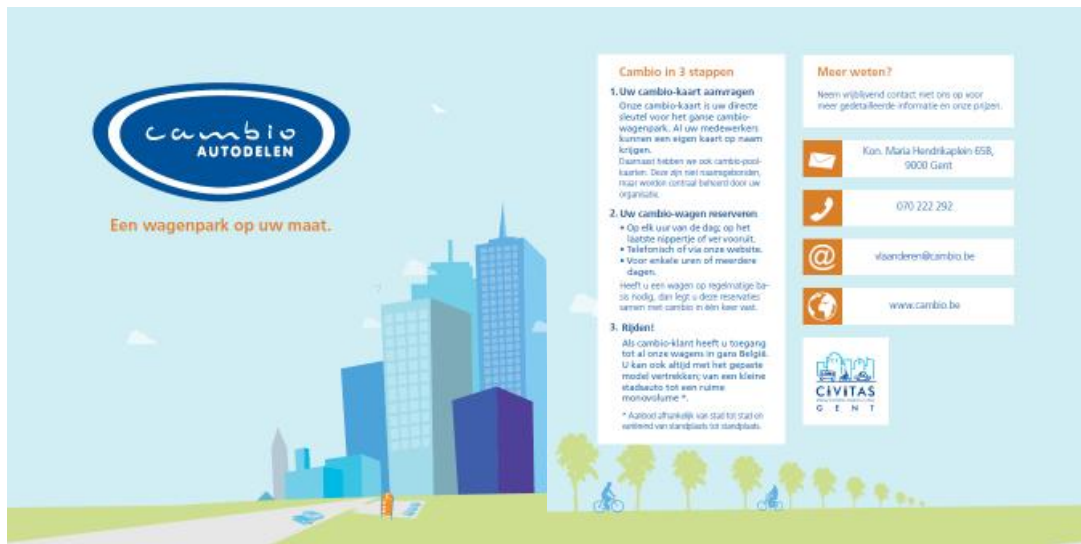
Cover and back cover of the business flyer produced within the ELAN project