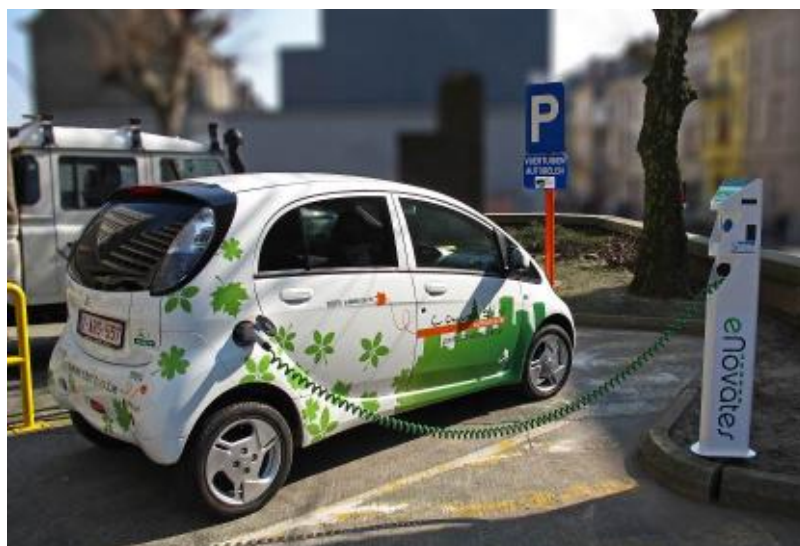
The new carsharing station AC Portus – a combination of 2 'classic' cars and an electric car (link to measure 1.9-GEN)

For this pilot project a carsharing station has been opened on the premises of the city (at AC Portus). A link with measure 1.9-GEN has been established by opening at this location the first e-charging station for the electric cambio car.