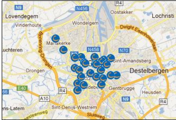
Spread of the carsharing stations in Ghent (April 2012)