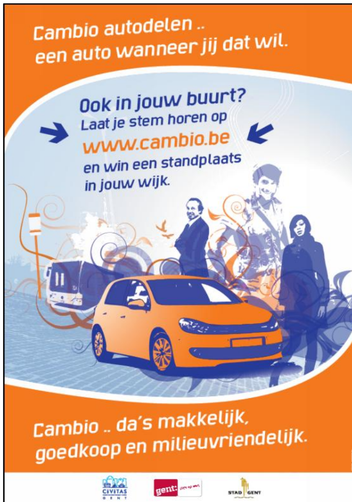
Poster for the "Vote a carsharing car in your neighbourhood" campaign, spread all over the city

Several new stations were opened in addition to the station which was foreseen within the frame of the project.