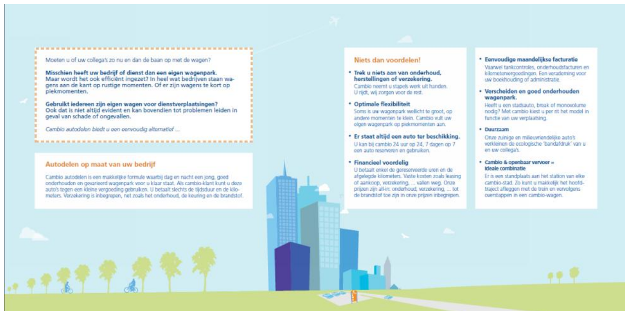
Inside content of the business flyer produced within the ELAN project

It should be emphasised that – in accordance with information campaigns towards private users – carsharing for business users is a rather new ‘service’. One needs to be aware that companies probably won’t decide immediately to change their existing mobility patterns and to switch to carsharing. An information campaign mainly has the purpose to introduce the concept and to be sure that such organisations are aware of carsharing as a possible solution for their needs or mobility problems in the future.