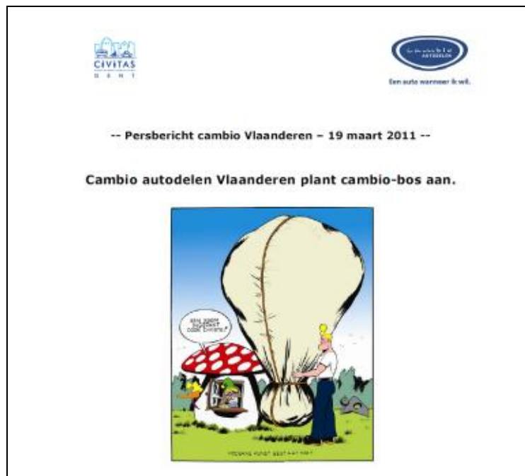
Cover of press announcement about tree planting action.

The 2010 campaign was so successful that it was repeated in 2011 (September 2011 – November 2011) with a new layout, a new 'game' etc., but based on the same two pillars: offering a trial period and working via mouth-to-mouth communication.