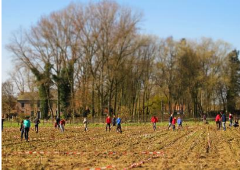
Cambio users, planting trees.