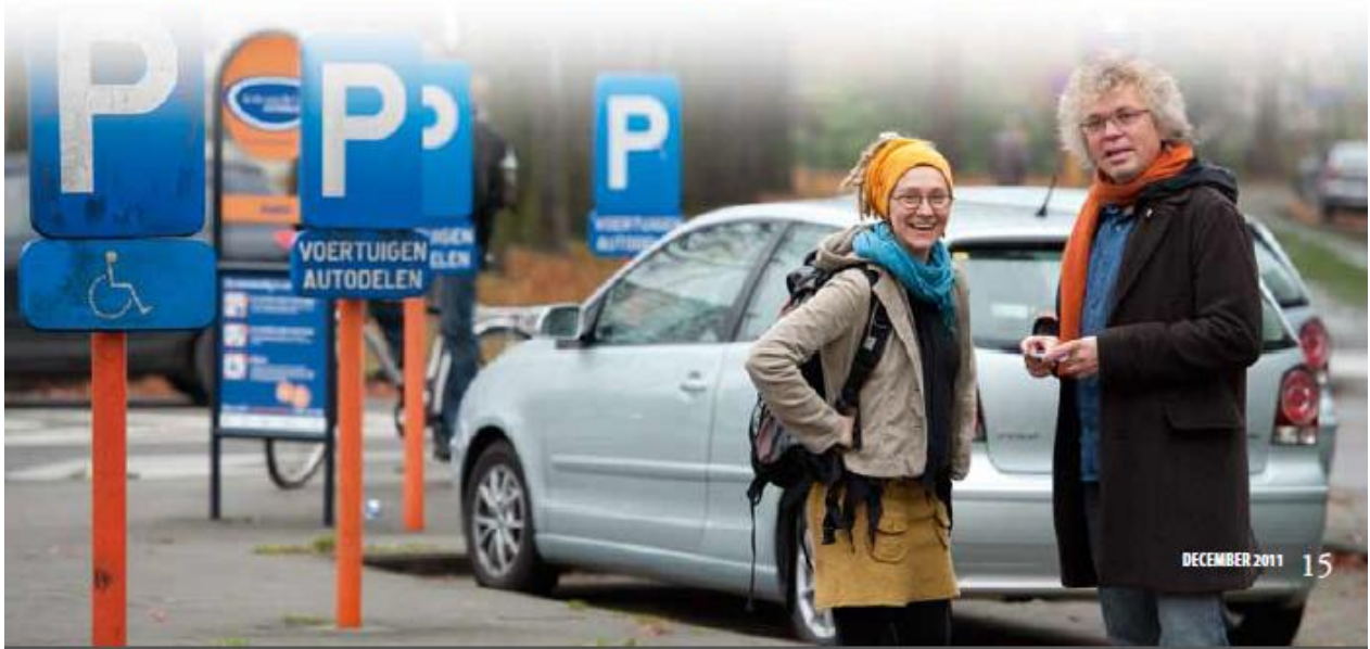
Article in the city magazine for the "Vote a carsharing car in your neighbourhood" campaign, distributed to all inhabitants of the city.

Dienst Mobiliteit - CIVITAS Ramen 21, 9000 Gent ☎ 09 266 29 80 ✉ info@civitasgent.be 🌐 www.civitasgent.be Bevoegd: schepen Martine De Regge