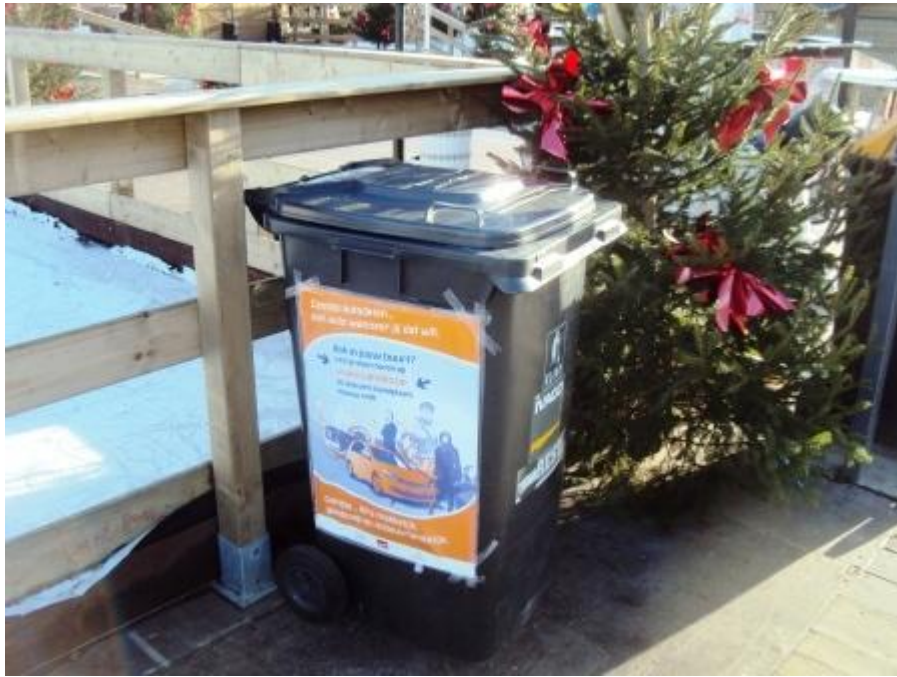
Posters at the winter market in Ghent