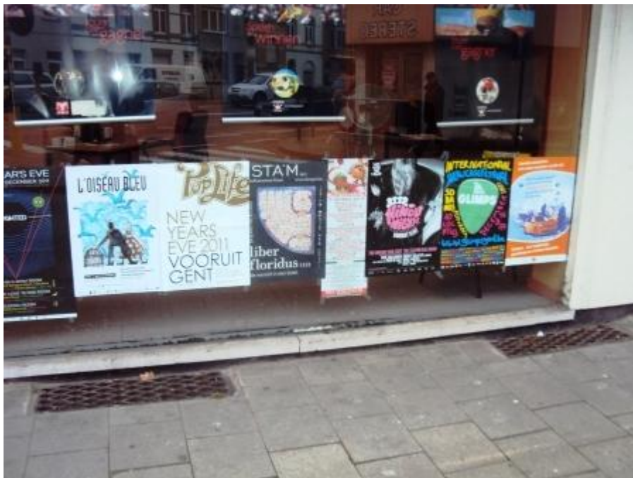
Posters at the entrance of a shop in Ghent