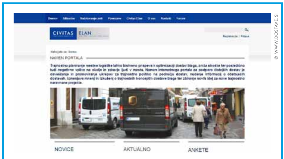
The national web portal for supporting sustainable freight logistics ( www.dostave.si )