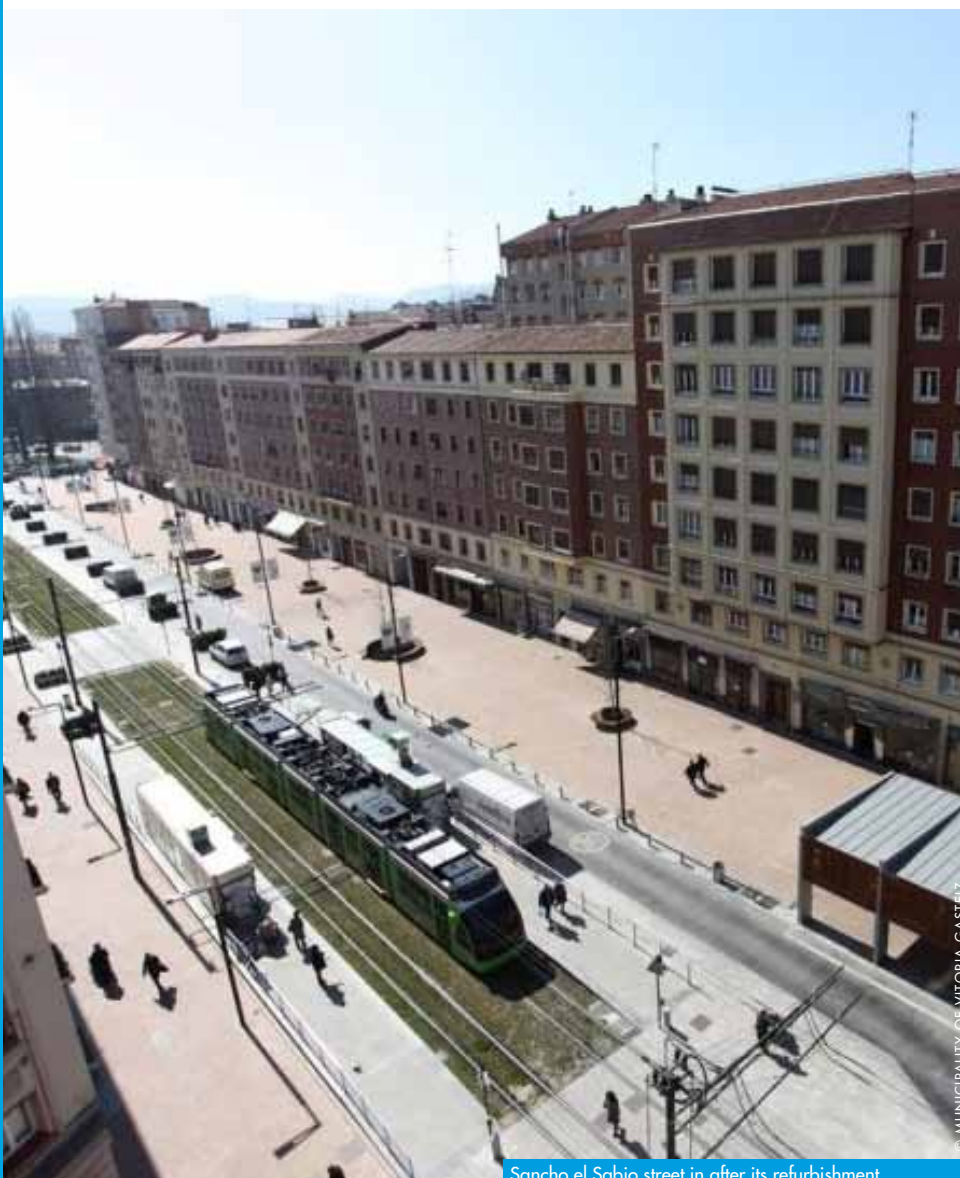
Sancho el Sabio street in after its refurbishment