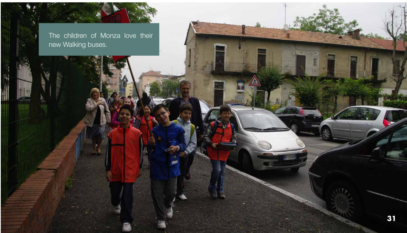
The children of Monza love their new Walking buses.

A stronger commitment at different levels is required to allow the full and systemic implementation of all Monza's measures as well as the adoption of common communication strategies and policies.