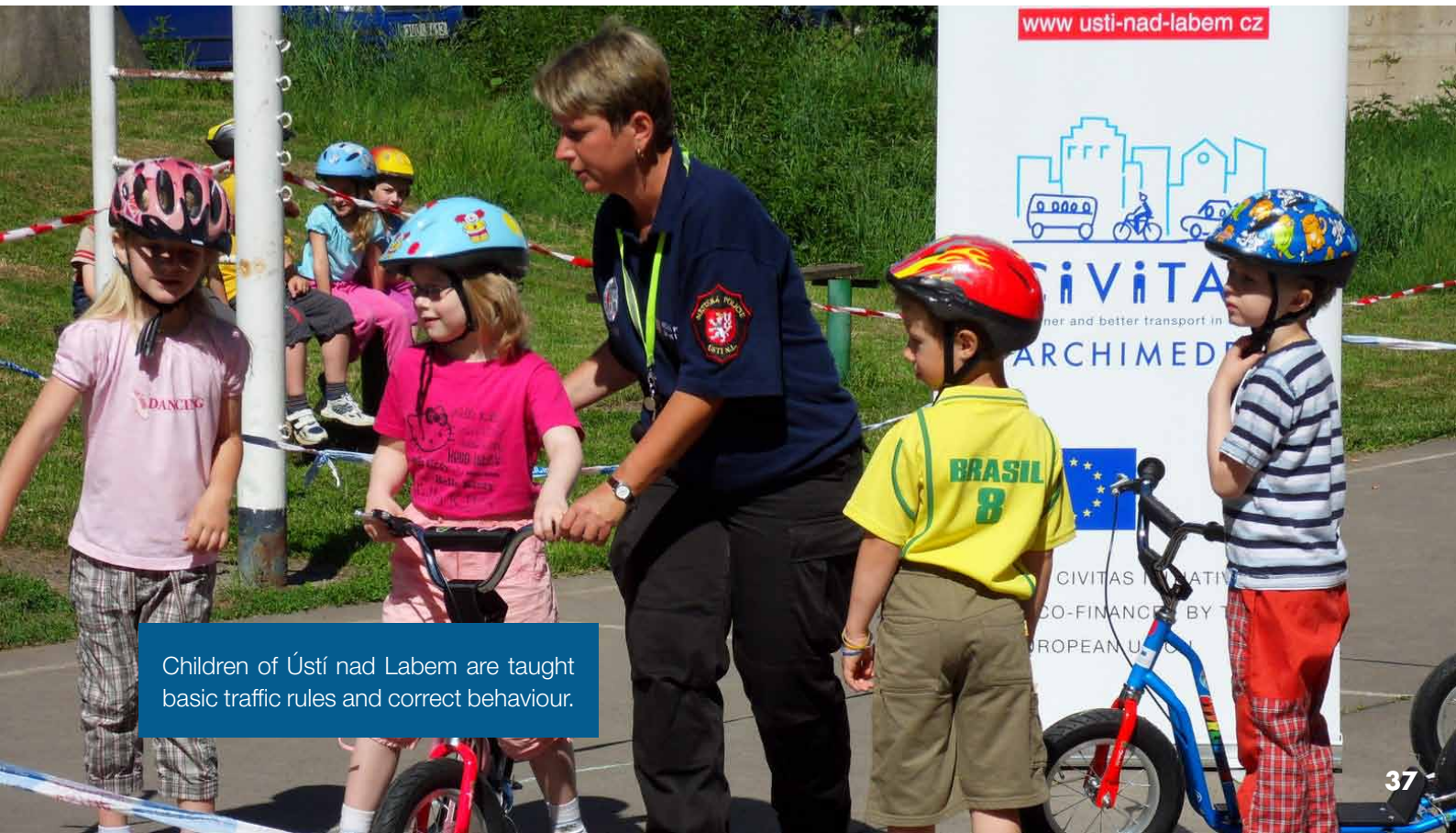
Children of Ústí nad Labem are taught basic traffic rules and correct behaviour.