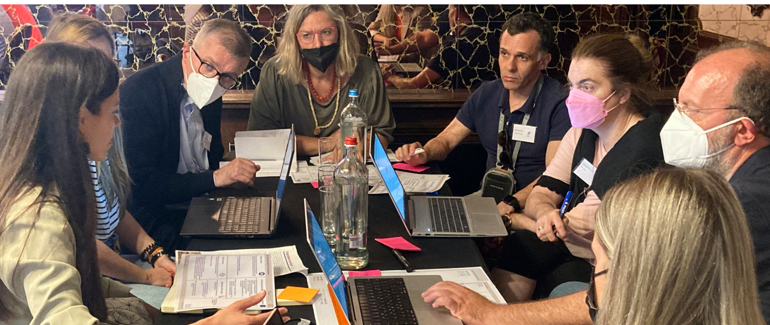
FastTrack cities exchange knowledge on 'Funding Day'

Ronald Kleverlaan mapped how cities can leverage public-private partnerships with start-ups, including by offering them coaching, fund matching, or by carving-out space for start-ups in public procurement protocols.